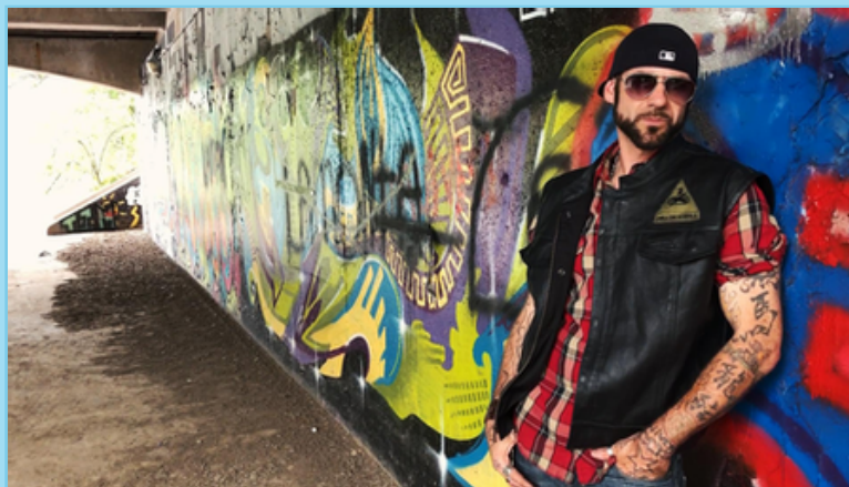
Angel (Diary of an Outlaw) - Music Interview